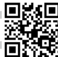
PLATE BEVELLING MACHINE - HEAVY DUTY KBM-28®